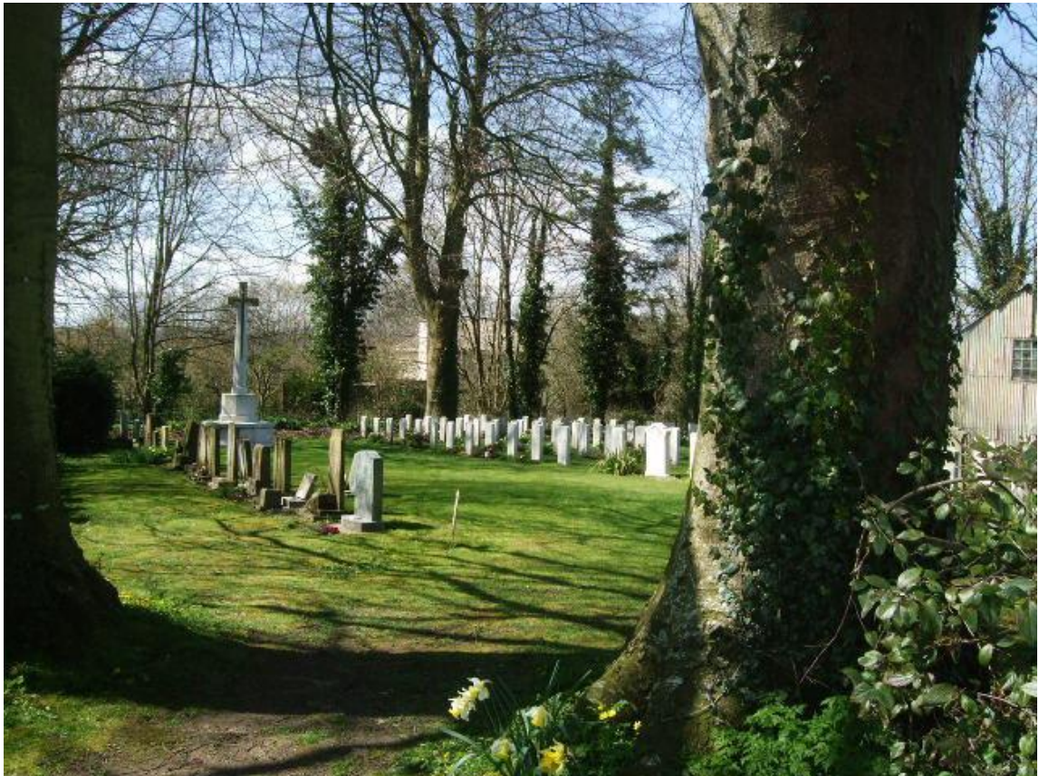
St. Mary's New Churchyard, Codford