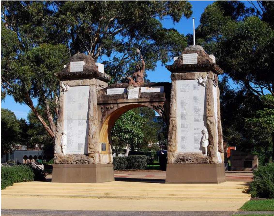
War Memorial Arch at MacCabe Park, Wollongong