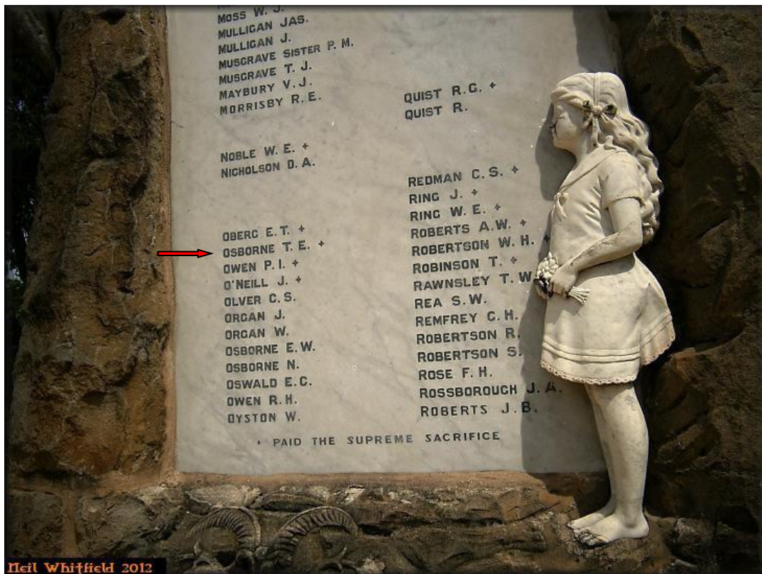
War Memorial Arch at MacCabe Park, Wollongong